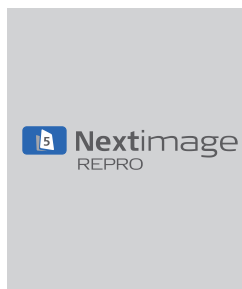
Nextimage REPRO software