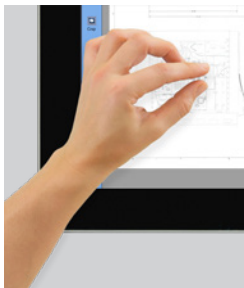
Touchscreen Full HD 22" touchscreen