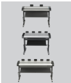
Your choice of scanner IQ Quattro X 44 inches HD Ultra X 42 inches HD Ultra X 60 inches